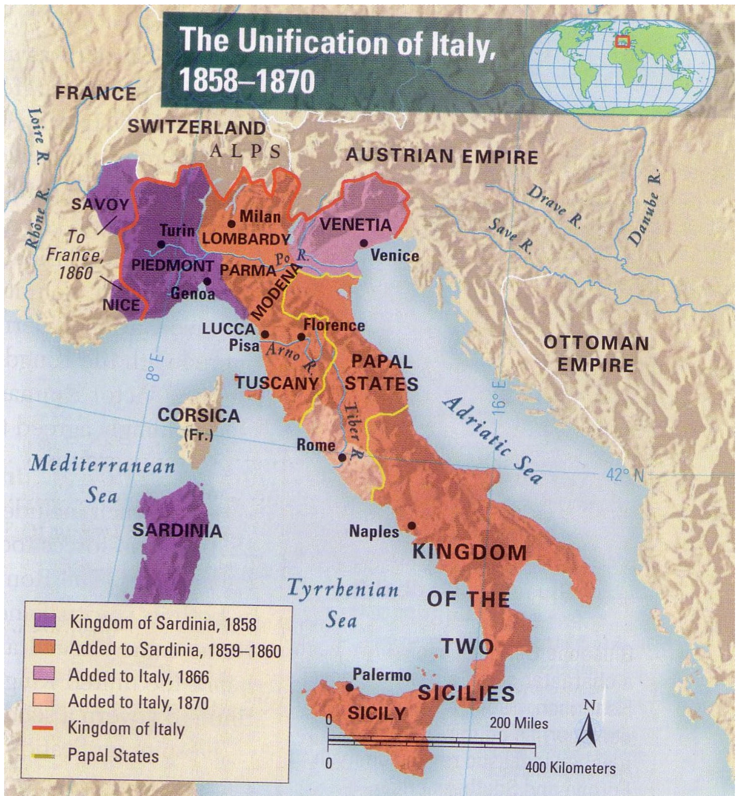
Map of The Unification of Italy 1858-1870