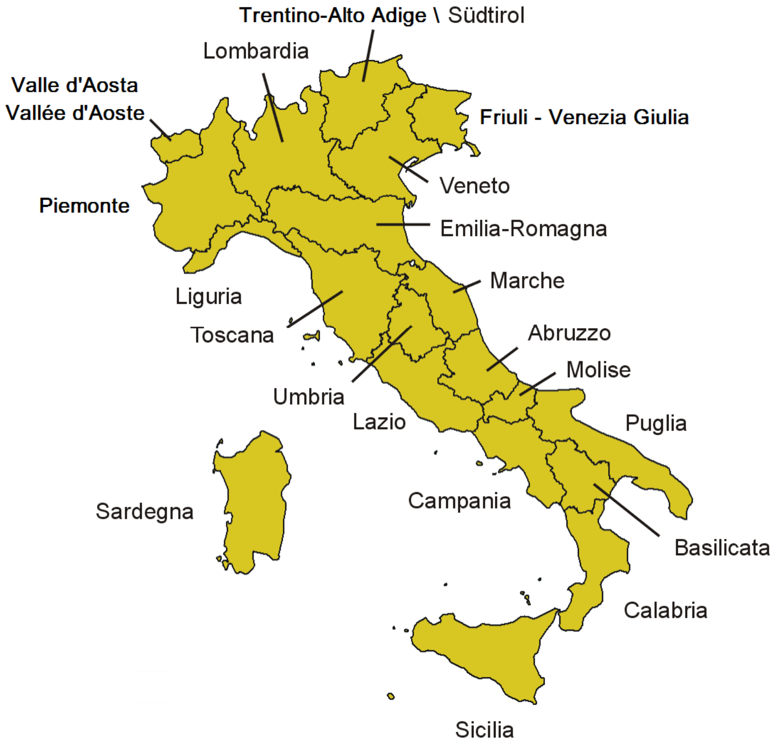
Map of Italy